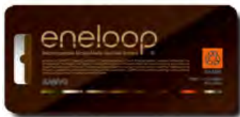
AA size nickel-metal hydride rechargeable batteries HR-3UTGB-8C