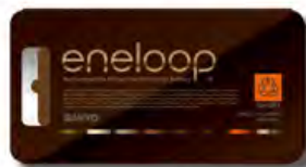
AAA size nickel-metal hydride rechargeable batteries HR-4UTGB-8C