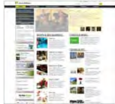
Tokyo Midtown DESIGN TOUCH 2011 website