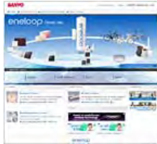
eneloop global site