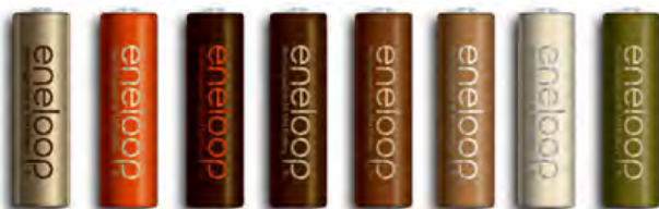
Both AA size and AAA size batteries come in the same range of colors.