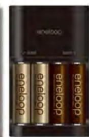
“eneloop tones chocolat” double/triple speed charger set with 4 AA size batteries BC-KJR01C34

The batteries themselves are the recently announced new “eneloop” batteries due to be released on the same day. These new “eneloop” batteries feature a number of improvements over previous models* 5 , such as improved low self-discharge technology, which allows them to maintain their capacity for a longer period, with approximately 90% remaining after a year and