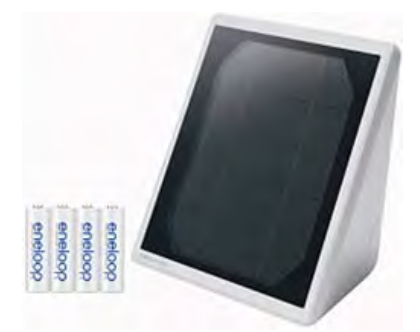
SANYO eneloop solar charger (N-SC1AS)

In addition, in case of electric power failure, "eneloop" batteries can be recharged with solar energy generated by the SANYO eneloop solar charger.